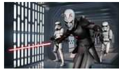
Animated 'Star Wars Rebels' Has Throwback Feel