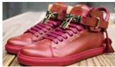
An $800 Sneaker Plays Hard to Get