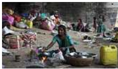
New Poverty Formula Is Test for India