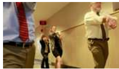
When It Comes to Office Work, You Can't Be Too Careful