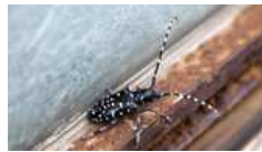
Trees Get the Ax in War Against Asian Beetle